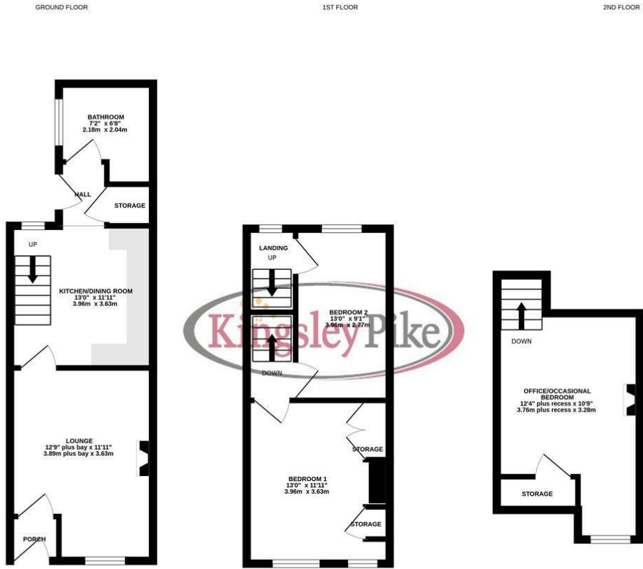
TWO BEDROOM TERRACE HOUSE

Whilst every attempt has been made to ensure the accuracy of the floorplan contained here, measurements of doors, windows, rooms and any other items are approximate and no responsibility is taken for any error, omission or mis-statement. This plan is for illustrative purposes only and should be used as such by any prospective purchaser. The services, systems and appliances shown have not been tested and no guarantee as to their operability or efficiency can be given. Made with Metropix ©2025